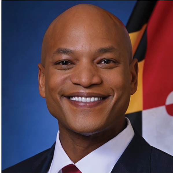
Featured Presenter Wes Moore Governor State of Maryland