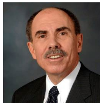
Speaker Bob Wise Former Governor, West Virginia Coordinator, Global Science of Learning Education Network (GSoLEN)